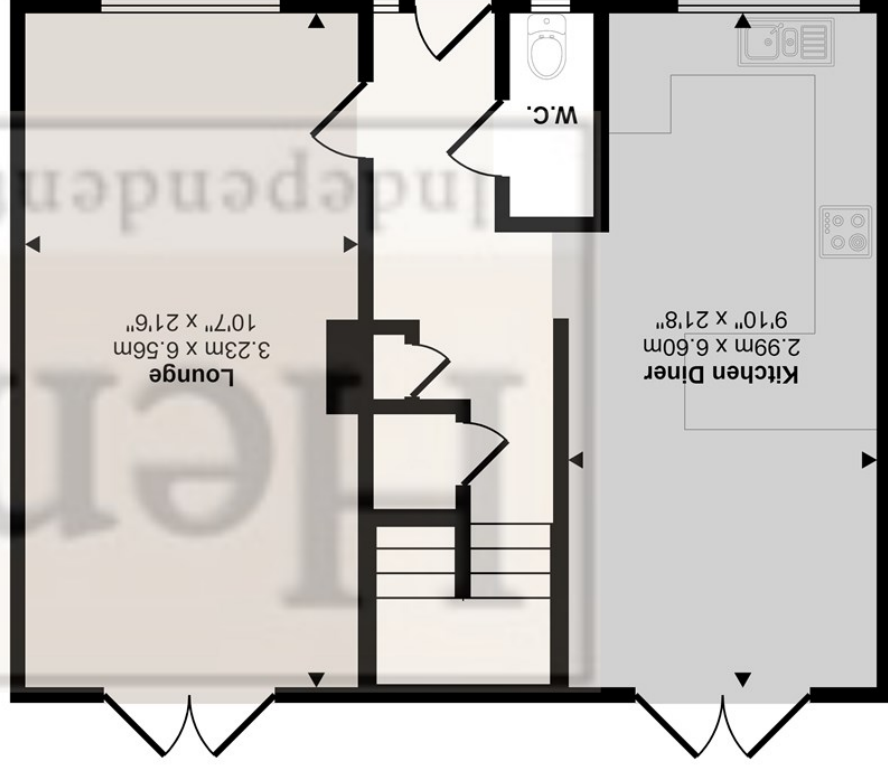
Approx Gross Internal Area 99 sq m / 1068 sq ft